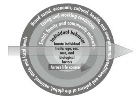
Fig. 1. Ecologic Model of Health. (Adapted from Healthy People 2020).

small towns, but in recent years have been more suspect at the national level. Indeed, marketing forces and commercial interests have stoked individual desires at the cost of the common good. This has led to enormous income disparities with over 10 percent of the population living below the poverty level (as compared with 6 percent in France) and faced with associated social and environmental disadvantages, failing schools, broken families, toxic exposures, and fears of violence. The US stresses equality of opportunity but fails to provide an equal right to medical care. In the public health of the future, a better balance will need to be achieved (see Figure 1).