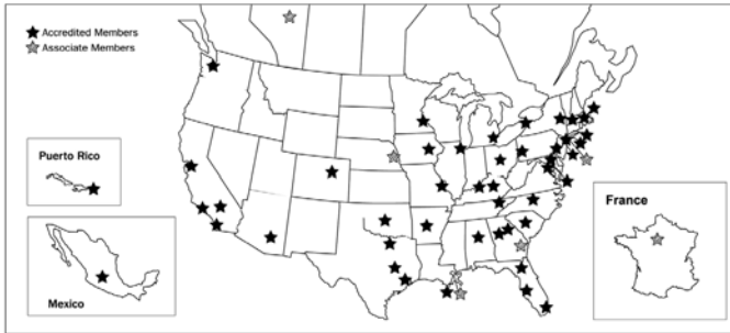
Fig. 1. Map of ASPH Accredited and Associate Members. This map of ASPH membership is from January 2011. ASPH represents the 46 CEPH-accredited SPH and the six associate members that intend to become fully accredited SPH through a formal review process administered by CEPH.

SPH, not just in the US but internationally with inclusion of an accredited school in Mexico and an associate member school in France, which is in the process of accreditation. ASPH membership includes all CEPH-accredited member schools, 46 in 2011 (Figure 1), 16,17 which together, graduate over 8,000 students each year.