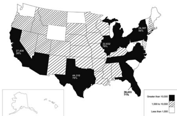
Fig. 3. The Projected Public Health Workforce Shortage in 2020, US by State. This map illustrates projected shortages of state public health workers from data compiled in 1998 by the ASPH Taskforce on the Public Health Workforce. Data was based on state estimates provided by the Association of State and Territorial Health Officials.

Even that number is undoubtedly conservative, since public health departments across the US absorbed substantial personnel cuts during the recession of 2008-2010. Extrapolation of these data to projected shortages by state is demonstrated in Figure 3. These estimates also do not take into account the large potential retirement effects of an aging worker cohort. Although some retirements may be postponed due to the economic recession, by 2012, more than 110,000 US public health workers in government—24 percent of an estimated 450,000-person workforce—will be eligible to retire. In addition, the estimates are supply-based and do not attempt to quantify need or demand or the serious issue of geographic distribution and discipline-specific projects (e.g., laboratory workers vs. epidemiologists).